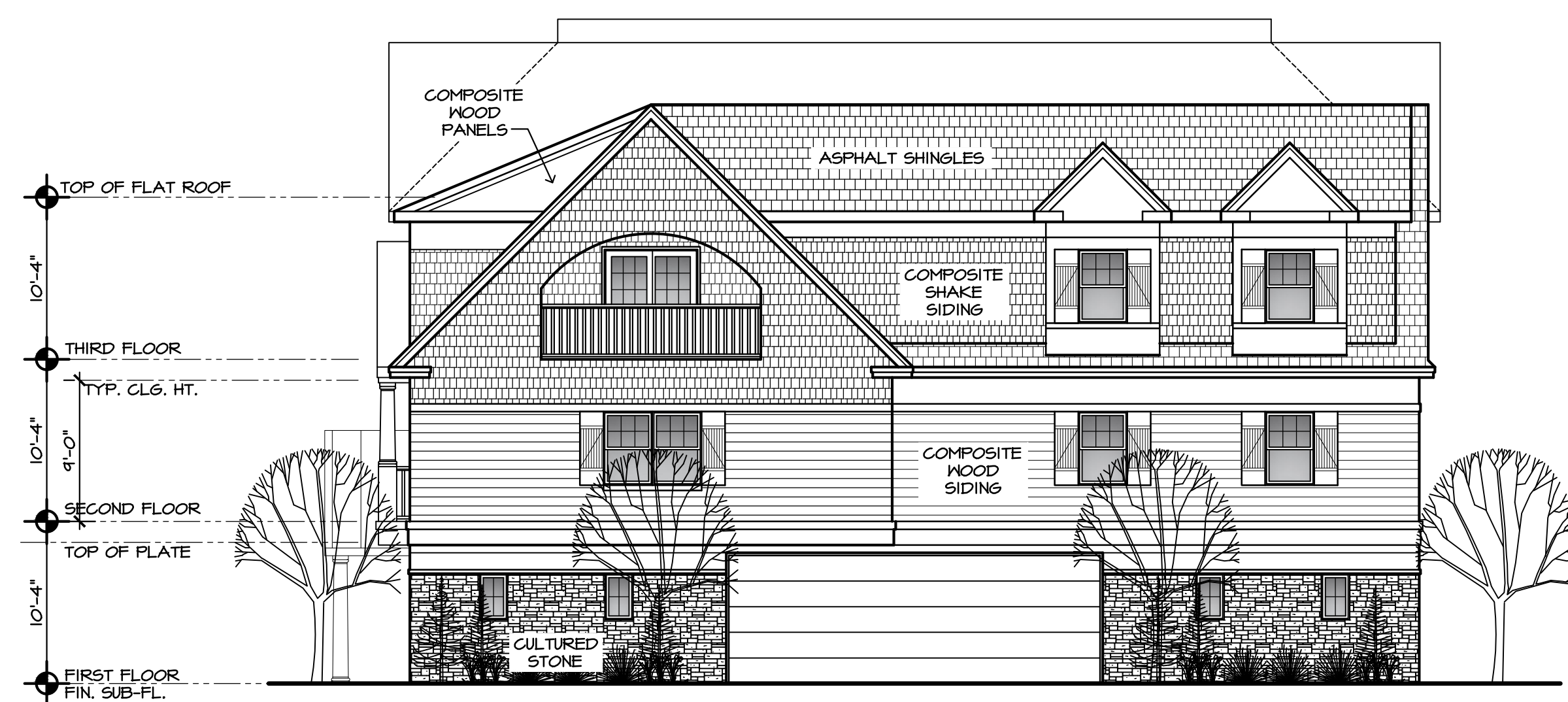
C TYPICAL SIDE ELEVATION