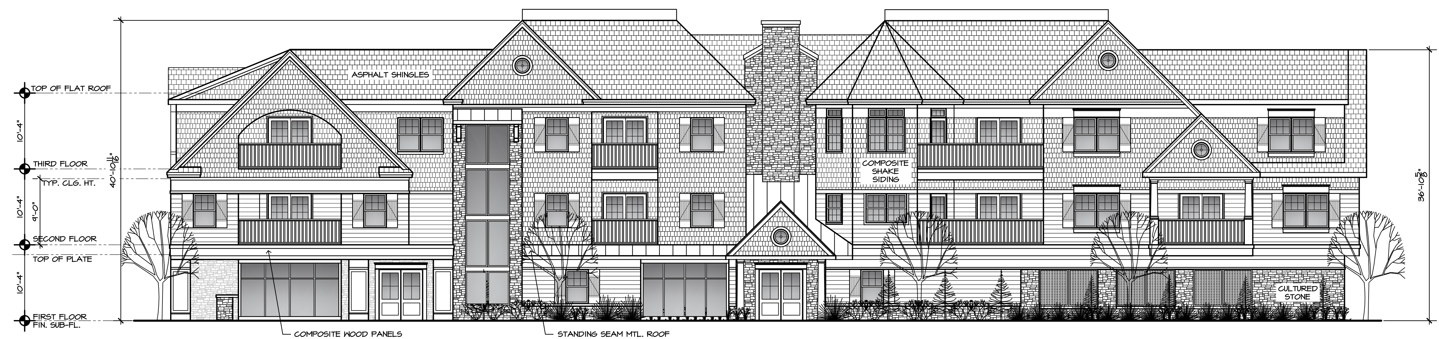
2 | FRONT ELEVATION OF BUILDING W/ CLUBHOUSE