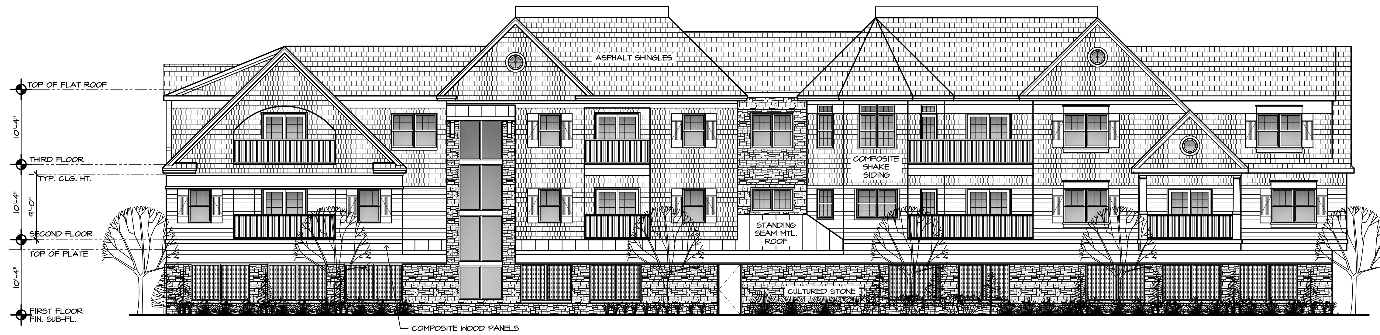
B REAR ELEVATION